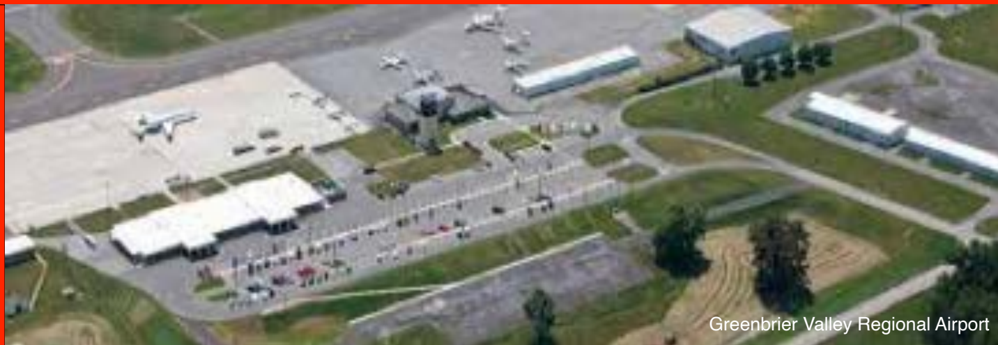
Greenbrier Valley Regional Airport